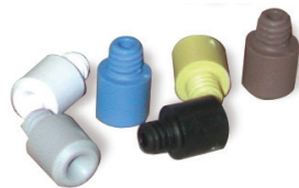
Metering Tips Part #NA0816A