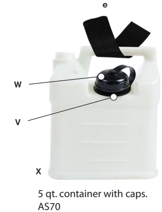
5 qt. container with caps. AS70