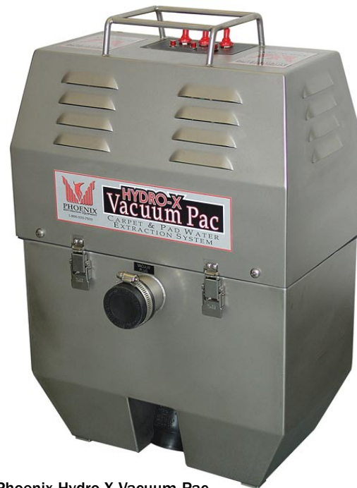
Phoenix Hydro-X Vacuum Pac PN 025601

The Vacuum Pac can be run separate from the Hydro-X Xtreme Xtractor and can run with standard wands, water claws, and any other extraction tool allowing for a 2 in. connector.