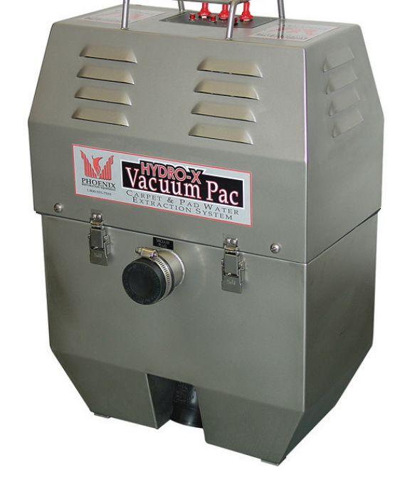
Patents: 6,152,151 6,629,333

The Vacuum Pac can be run separate from the Hydro-X Xtreme Xtractor and can run with standard wands, water claws, and any other extraction tool allowing for a 2 in. connector.