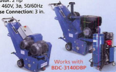
Works with BDC-3140DBP

Cleaning Path: 13.2 in. Prod. Capacity: Up to 570 sq.ft./hr. Drum Diameter: 8.5 in. Drum Speed: 1000 rpm Engine: 15 hp Hatz Diesel Drum Motor: 15 hp hydraulic Drive Motor: 2 hp hydraulic Dust Hose Connection: 3 in.