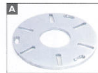
Redi Lock™ diamond holder disc.