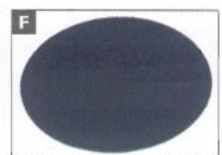
Resin holder disc replacement velcro pad.

Use the QR-tag to check out more about the PG 820.