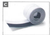
Rubber skirt, non marking.