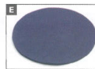
Resin holder disc replacement rubber pad.